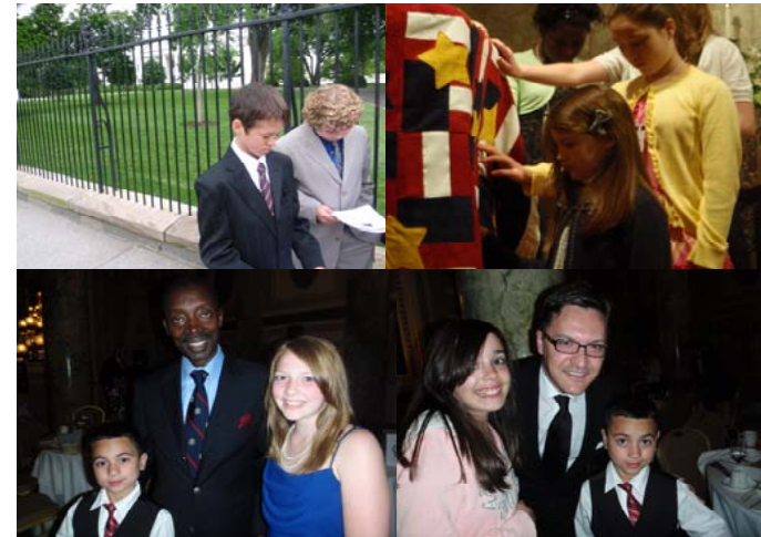
Prayer at the White House and St. John's Church Jewels of Peace Diplomatic Dinner Delegates and Ambassadors

In this time of fearful anxiety and unrest in our world, the National Children's Prayer Congress and Children's Embassy Publications are working together to extend the treasure of hope through the Jewels of Peace Diplomatic Dinner and the contributions and prayers of these student delegates.